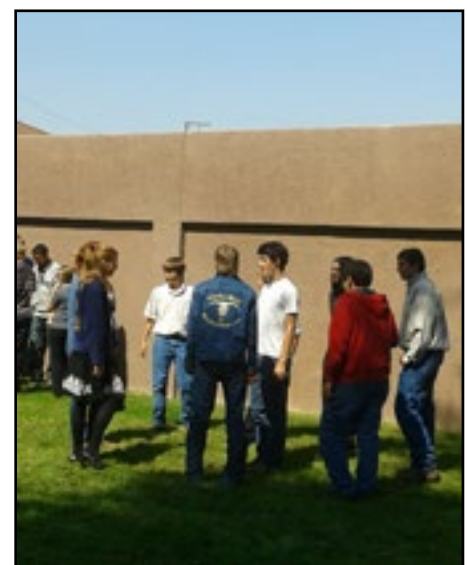
Students participate in team building skills during the conference