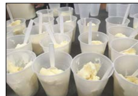
Pictured above: Ice cream in cups lined up ready for students to fill up with soda