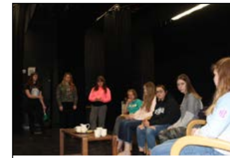
Pictured above: Drama class practicing for their play

sion will be $5 and there will be concessions available at the beginning of the play. The drama class hopes to see lots of people in the audience on May 10th for, "Where There's a Will There's a Murder." They have been hard at work on it for a long time.