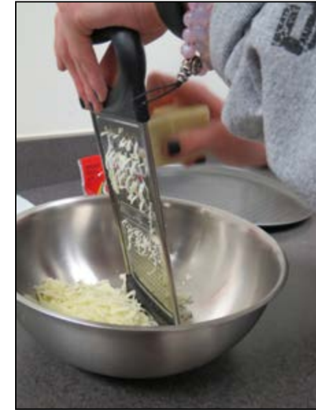
Pictured above: Turning a block into tiny shreds