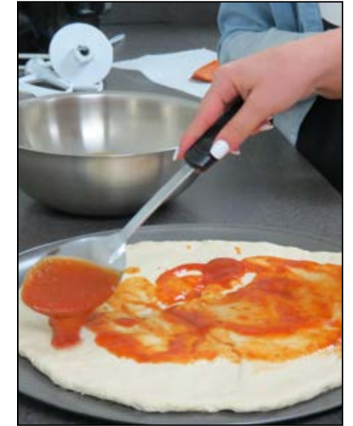
Pictured above: Spreading out a layer of sauce