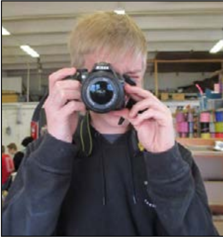
Pictured above: Last year's FFA oyster fry shows what a huge success this fundraiser is