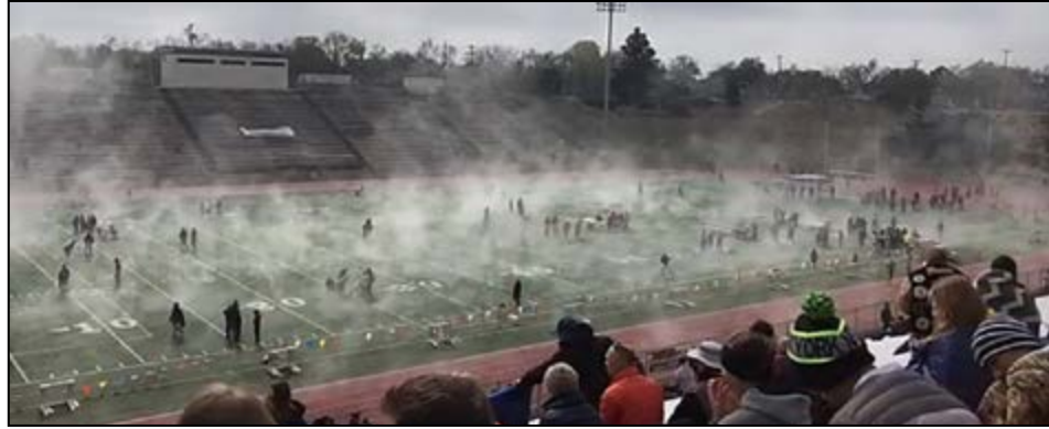
Pictured above: Fog rises as Rye track and field brings in the storm