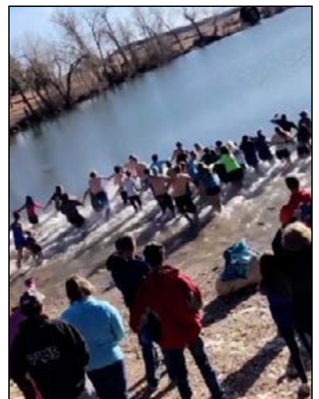
Pictured above: The Polar Plunge that will be held yearly