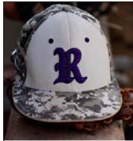
Pictured above: The team hat set up before the game